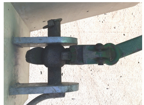
Tractor Weight Coupling Arrangement