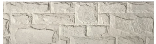
Random Rock Face