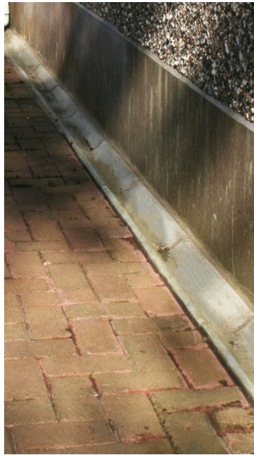
6" x 3" Water Channel