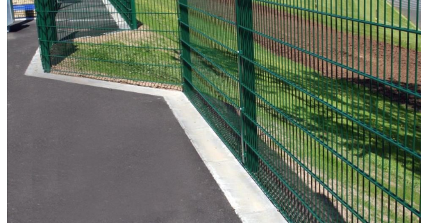
10" x 5" Pressed Water Channel