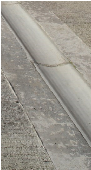
6" x 2" Water Channel

Water channels provide effective water management. They are suitable for both domestic and commercial use.