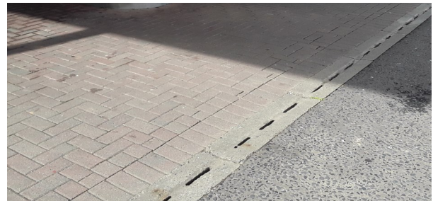
10" x 10" Slotted Drainage Channel