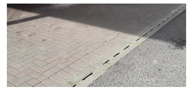
10" x 10" Slotted Drainage Channel