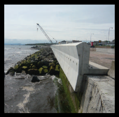
FEATURED PROJECT Kirkcaldy Sea Wall (VOLKER STEVIN)