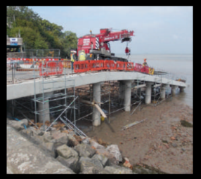
FEATURED PROJECTS RNLI Ramp Portishead (Andrew Scott), Lerwick Pier Extension (Tulloch Developments)