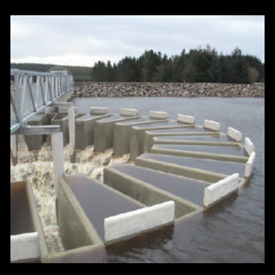
FEATURED PROJECT Black Esk – Piano Key (Black & Veatch)

Moore Concrete are leading Precast Concrete Manufacturers serving customers throughout the UK & Ireland. We are specialist manufacturers in the supply of bespoke job specific precast concrete units for the Civil Engineering Sector.