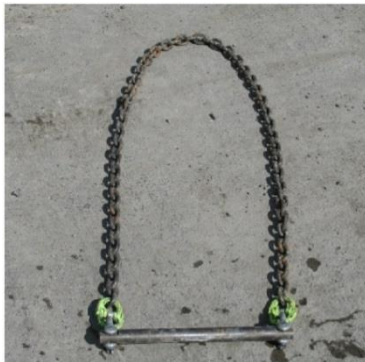
Turning Pin 1