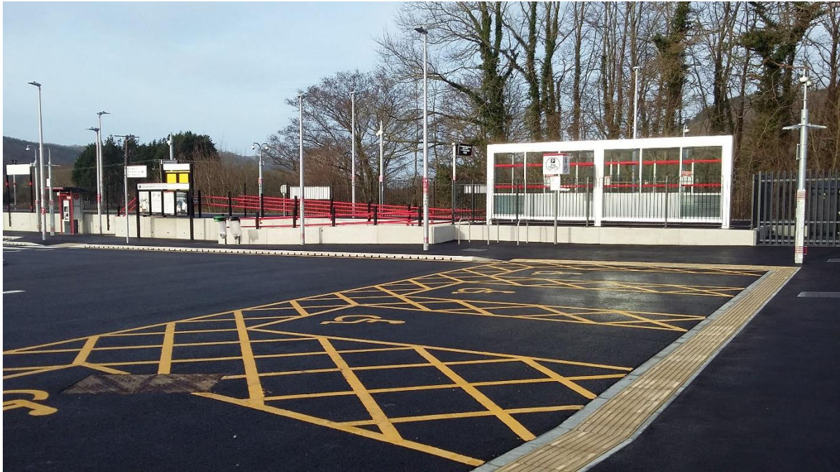
Figure 2: Bow Street Station