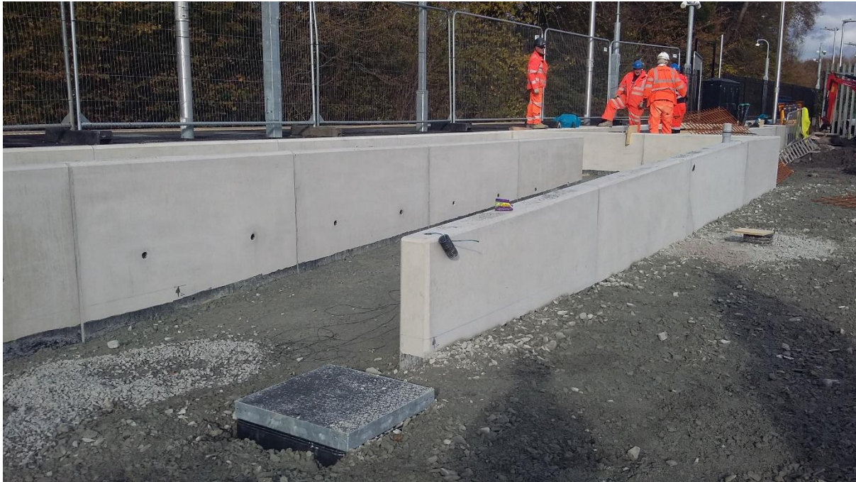
Figure 4: Access Ramp Installation Bow Street Station