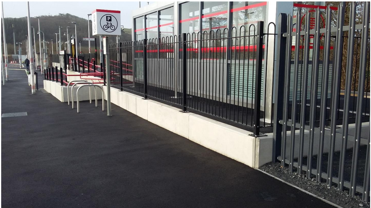
Figure 1: Ramp Units Installed, Bow Street Station

In the Bow Street project an early engagement approach with Alun Griffiths Contractors Limited allowed us to participate in a number of project meetings to discuss design, operational efficiency and improved project programming.