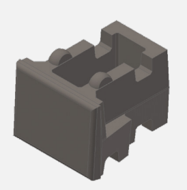
ID: RXL52 1320mm depth x 914mm tall 1511 kg