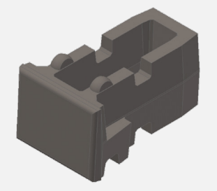
ID: RXL72 1830mm depth x 914mm tall 1888 kg